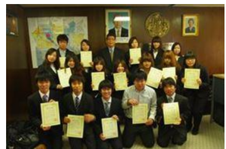
<the award of a certificate >