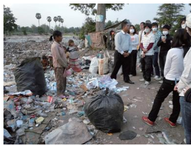
<Mountain of garbage>