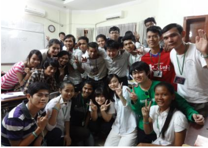
<Japanese language school>