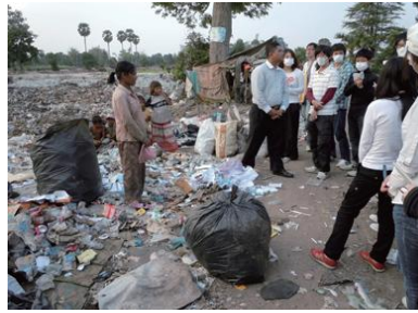
<Mountain of garbage>