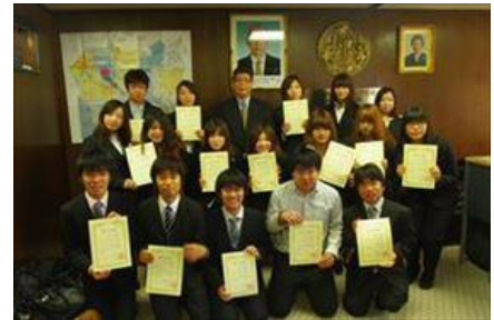
<the award of a certificate >